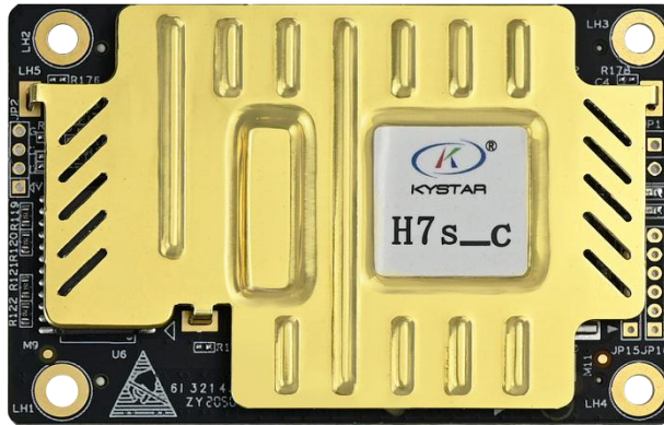
Figure 1 Front view of the H7s-c receiving card